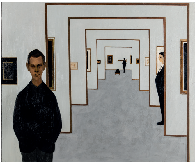
Gustav Stettler, Painting Gallery II , 1963–64, oil on canvas, 149.5 × 180 cm, Kunstmuseum Thun