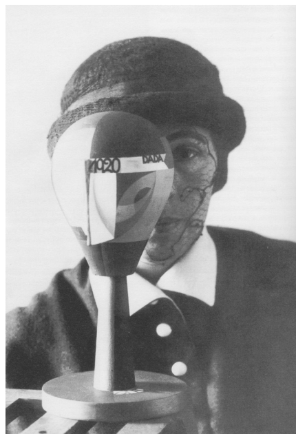
Sophie Taeuber with Dada head, 1920