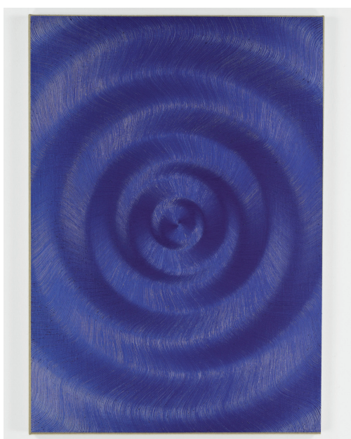
Giaocomo Santiago Rogado, Coalescence (Iridescent Violet Blue) , 2017, acrylic and oil on canvas, 100 × 70 cm.