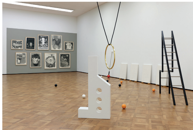
Exhibition view at the Kunstmuseum Thun, Cantonale Berne Jura , 2022/2023