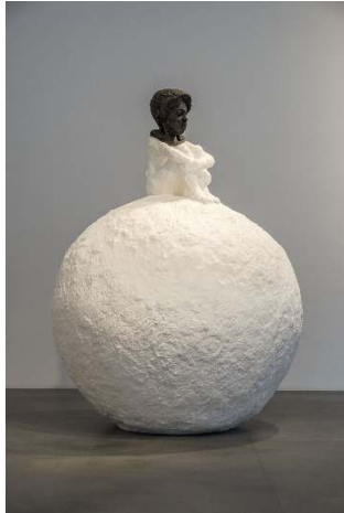
Lorna Simpson (b. 1960), Woman on Snowball 2018. Styrofoam, plywood, plaster, steel, epoxy coating Unique. 276.9 x 209.9 cm / 109 x 82 5/8 inches © Lorna Simpson Courtesy the artist and Hauser Wirth Photo: James Wang