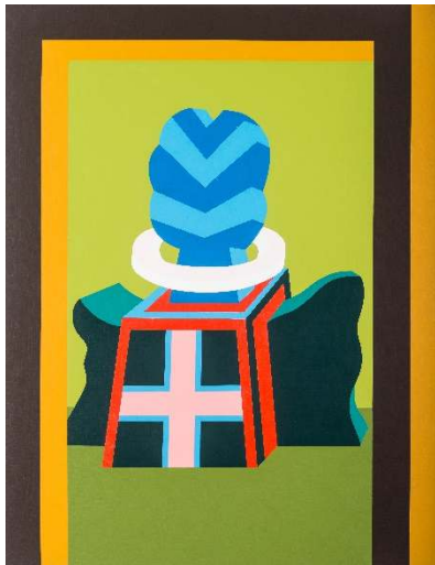
René Myrha, Porte 5.4.72 – 5.72 , 1972 Acrylic on canvas, 150 x 115 cm Kunstmuseum Thun © 2021, ProLitteris, Zurich