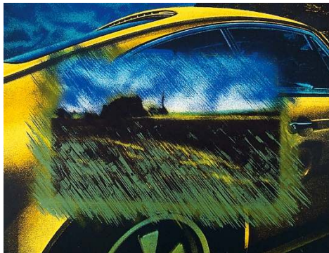
Hugo Schuhmacher, Fahrt ins Grüne (gelb) , 1976 Colour serigraph on Bristol board, 54.8 x 69.8 cm Kunstmuseum Thun